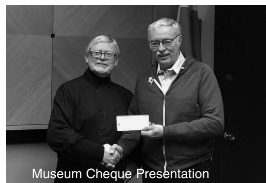
Museum Cheque Presentation