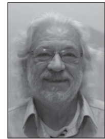
Peter Berg Director